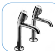
Model: 1/2 2158 QTSLCP 1/2-inch Sink Taps (pair)