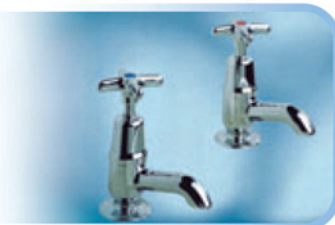
Model: 1/2 159 1/2-inch Basin Taps (pair)