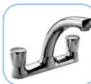
Model: P521 1/2-inch Deck Mixer