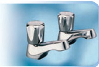
Model: P501 1/2-inch Basin Taps (pair)