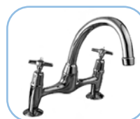
Model: 2523 1/2-inch Deck Mixer