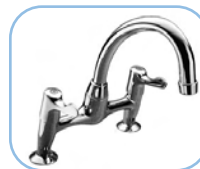
Model: 2523 QT 1/2-inch Deck Mixer