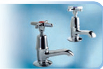
Model: 1/2 2159 1/2-inch Basin Taps (pair)