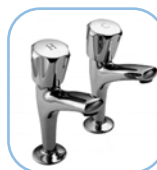
Model: P502 1/2-inch Sink Taps (pair)