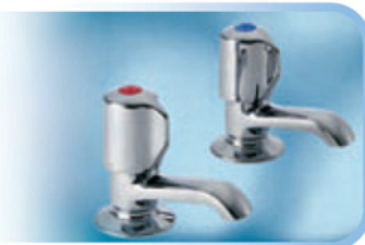
Model: 1/2 2159 QTSLCP 1/2-inch Basin Taps (pair)