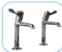
Model: 1/2 2158 QT 1/2-inch Sink Taps (pair)