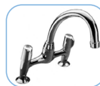
Model: 2523 QTSLCP 1/2-inch Deck Mixer