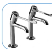
Model: 1/2 2158 QTELCP 1/2-inch Sink Taps (pair)