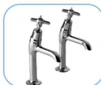
Model: 1/2 159 HN 1/2-inch Sink Taps (pair)