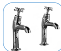
Model: 3/4 159 HN 3/4-inch Sink Taps (pair)