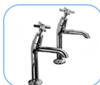
Model: 1/2 2158 HN 1/2-inch Sink Taps (pair)