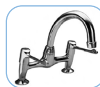
Model: 2523 QTELCP 1/2-inch Deck Mixer

Dimensions are in mm unless otherwise stated. Information and numerical data has been prepared as a general guide to the products but intending buyers & users must satisfy themselves as to the suitability and safety of the products for their particular purposes & duties. No responsibilities are assumed for errors herein. The company reserves the right to alter designs and specifications of the products without notice. NB: Product accreditation may not apply to all products in the relevant range. Please contact Mechline to confirm.