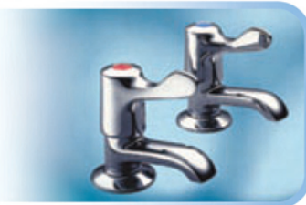
Model: 1/2 2159 QT 1/2-inch Basin Taps (pair)